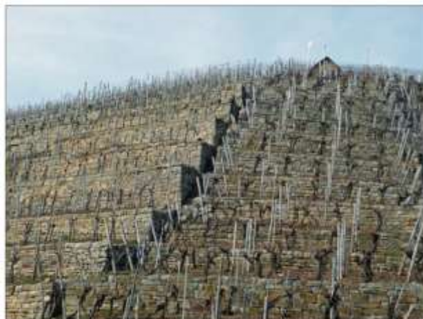
Photo: Historic terraced vineyards: expressive witnesses of European landscape culture

The German language network of ITLA from Central Europe will get together from 18 to 20 October 24 in the St. Ulrich Training Center near Freiburg. We will exchange our recent experiences, future initiatives and the topics of Terrace Pedagogy, Dry Stone Wall Courses as well as UNESCO Heritage proposals from Mosel and Rhein. Please inform me if you are interested to join the meeting by July 29.